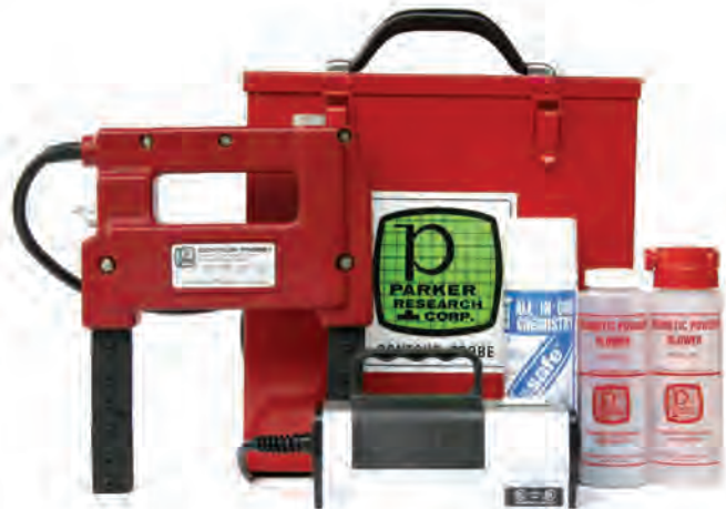
DA-400 SHOWN WITH "A/B" KIT ITEMS

WIDE VERSATILITY Mechanical flexibility plus selectively controlled solid state electronic features permit a vast field of applications. Mechanically, the Probe will conform to practically any surface configuration. The unique electronic circuitry contained in the molded handle permits selection of a strong constant AC magnetic field, or high intensity pulsed DC field.